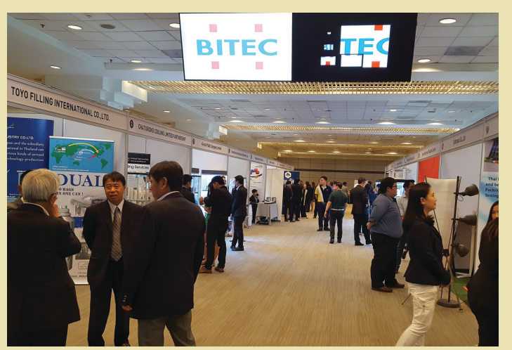
AAF Aerosol Exhibition at BITEC.

Additionally, the anniversary event included an AAF golf outing, gala awards dinner and tours of Thai Daizo and Alucon facilities.