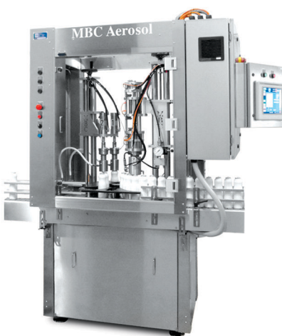
9 in, Rotary Index at 25 cpm High speed models up to 200 cpm