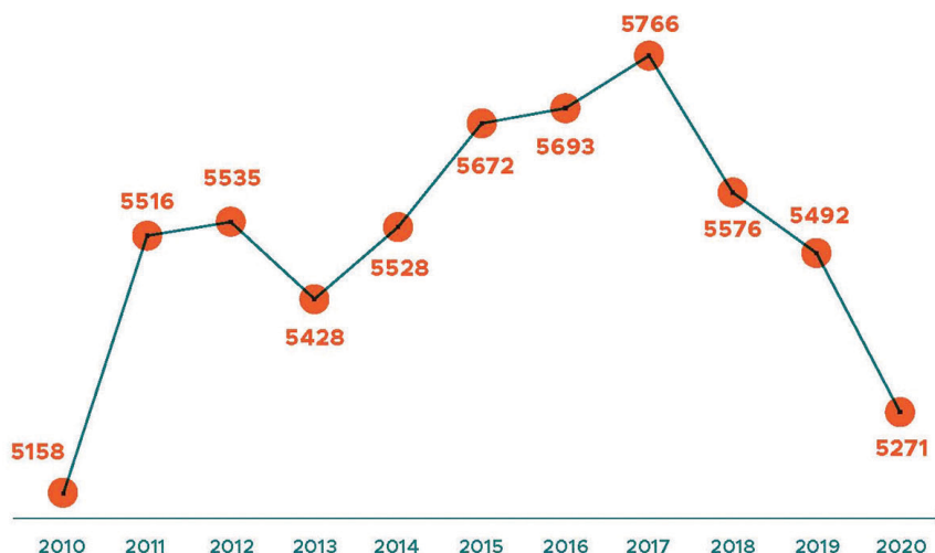
Fig.1. European production evolution (2010-2020, in '000 000 units)

According to reported fillings for European aerosol products, overall unit production reached 5.2 billion in 2020 , reflecting again a slight decrease from previous production numbers.